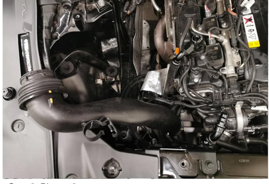
Step 6, Picture 2