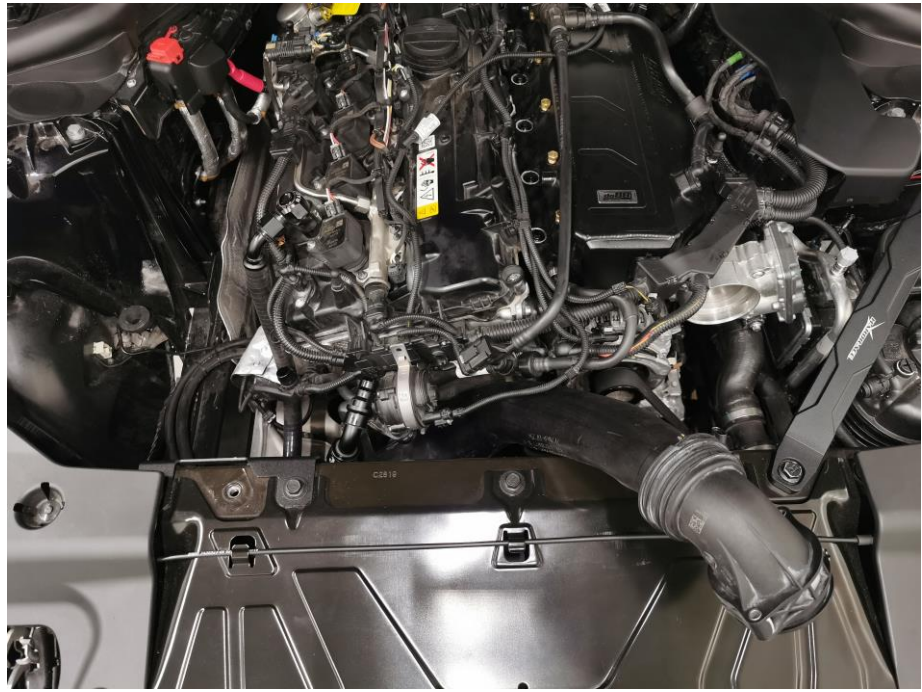
Step 6, Picture 1

Remove the clip holding the charge pipe to the turbo outlet. Then remove the charge pipe assembly from the car.